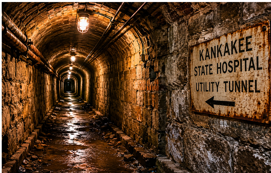
Tunnels beneath the Shapiro Developmental Center

Residents with information, photographs, historical documents, or personal stories related to underground tunnels in Kankakee are encouraged to contact InSight News Reader.