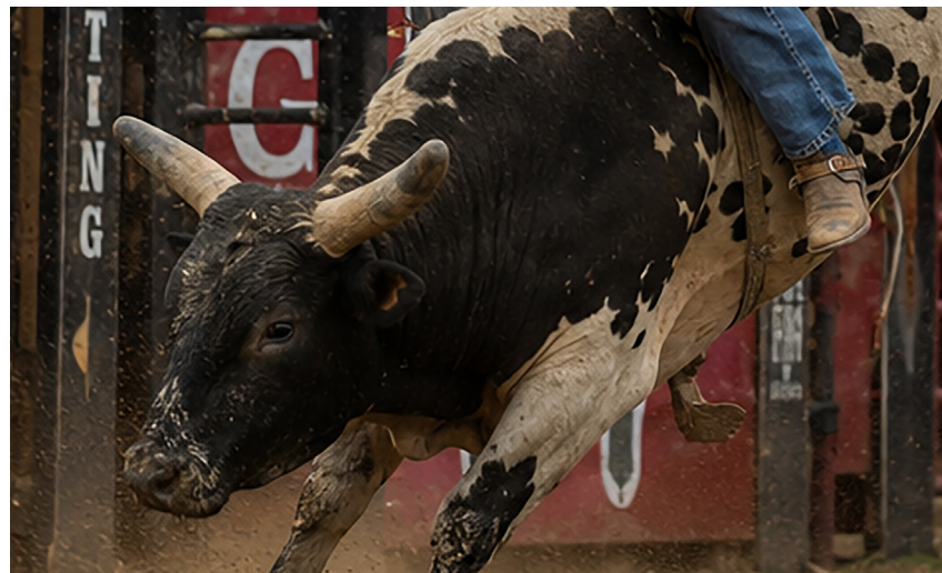
Bull Rider in Action at Pembroke Rodeo

With 50 years now in the history books, residents and visitors alike are already looking forward to next year's rodeo and the continuation of a tradition that has become a hallmark event for Kankakee County and the surrounding region.