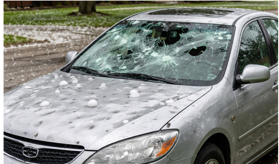
Hailstorm damage on a silver Sedan

without electricity as downed lines and damaged infrastructure overwhelmed utility crews.