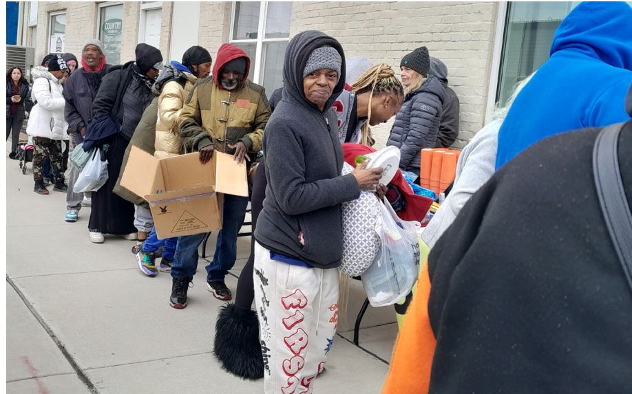
Still I Rise Disaster Relief Giveaway - Schuyler Avenue and Station Street (Kankakee)

Most recently, Still I Rise played a key role in disaster response following severe tornadoes that struck Kankakee County and nearby communities,