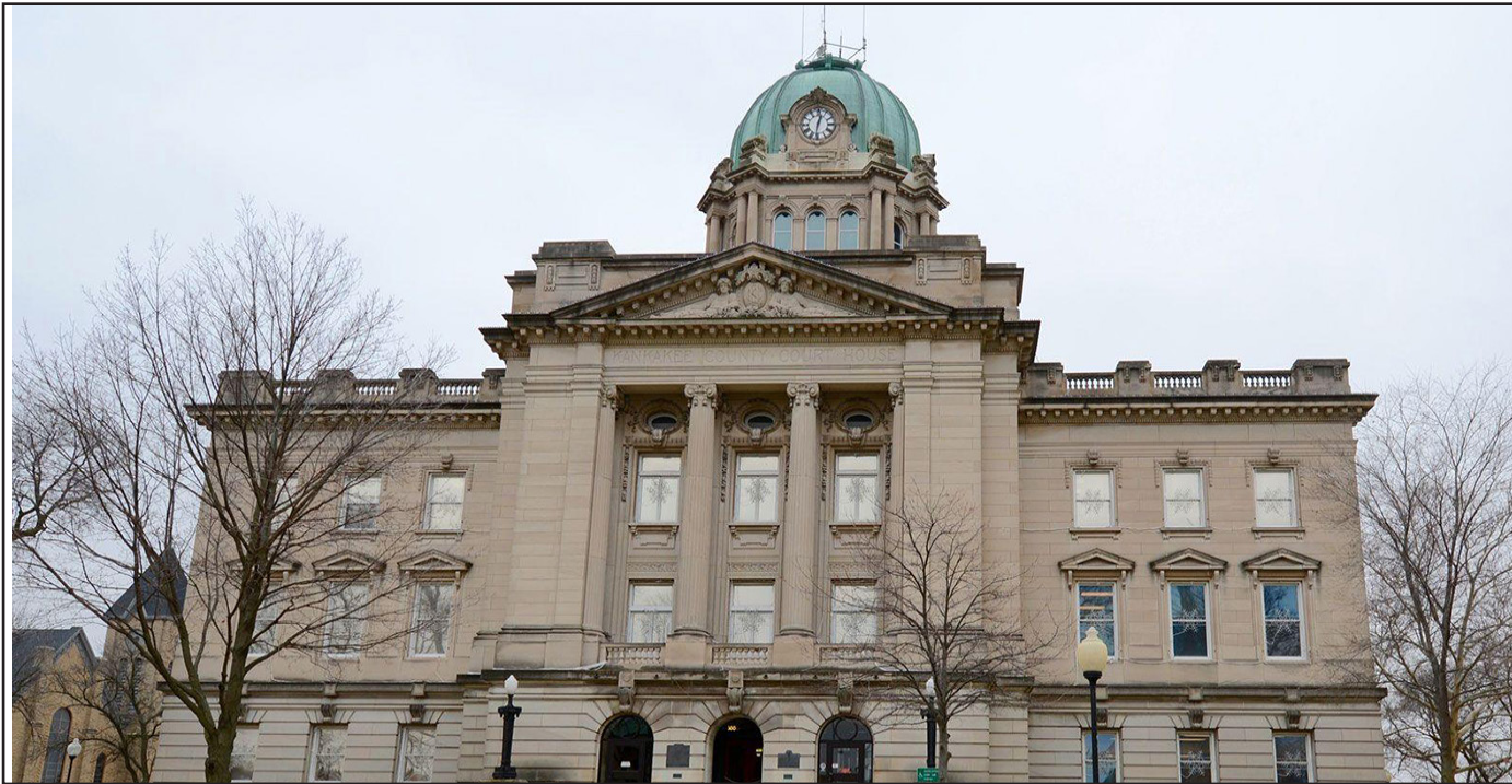
kankakee County Court House