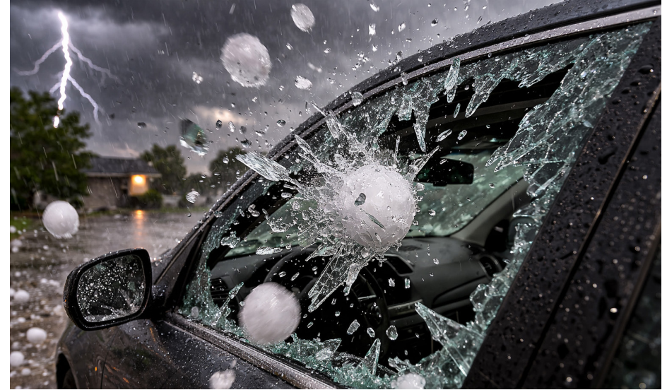
Hail blast into car window

The storm also produced massive hailstones, some reported to be as large as six inches in diameter, among the largest ever recorded in Illinois. Vehicles, siding, and rooftops across the region were heavily damaged by the unusual hail.